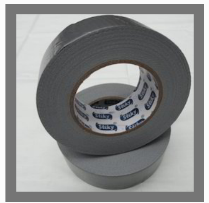
Binding Cloth Adhesive Tapes