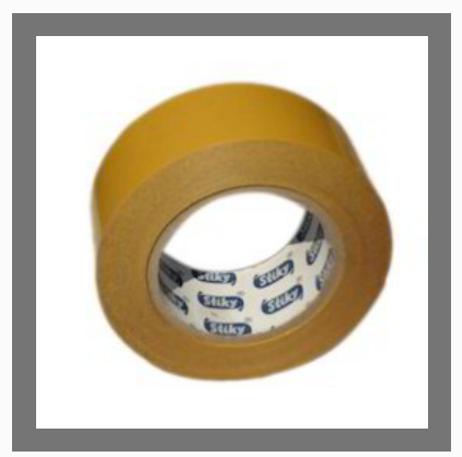
Double Sided Filmic Adhesive Tapes