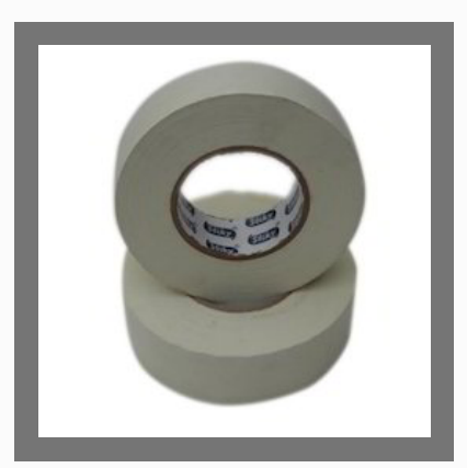
Water Proof Cloth Adhesive Tape