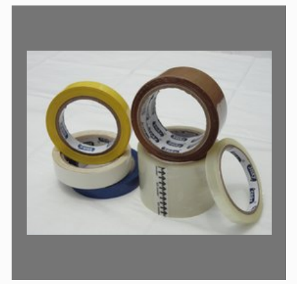
BOPP Transparent Adhesive Tapes