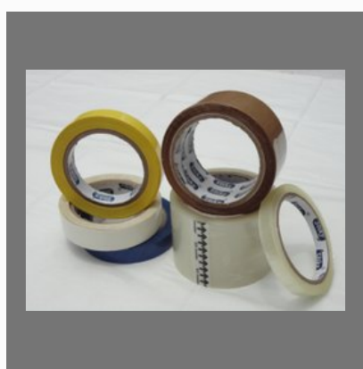
BOPP Colored Adhesive Tapes