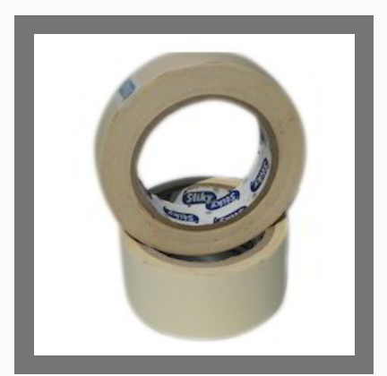
Masking Adhesive Tapes