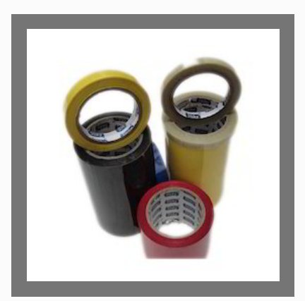
Polyester Electrical Insulation Adhesive Tape