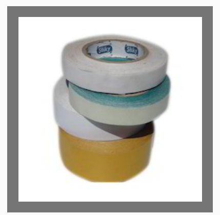
Double Sided Adhesive Tissue Tapes