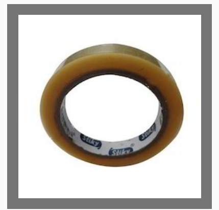
Cellophane Adhesive Tapes