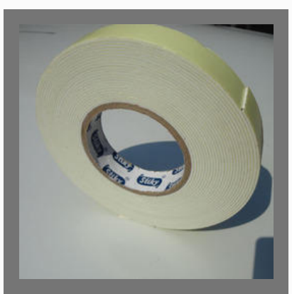
High Bonding Adhesive Tapes