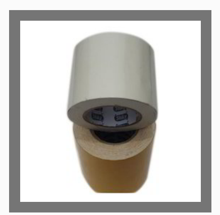
Double Sided Cloth Adhesive Tape