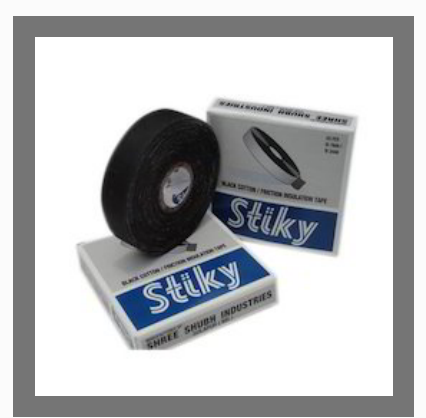
Black Cloth Insulation Adhesive Tape