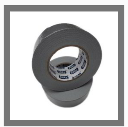
Duct Adhesive Tapes