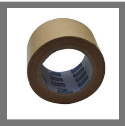
Kraft Paper Adhesive Packing Tapes