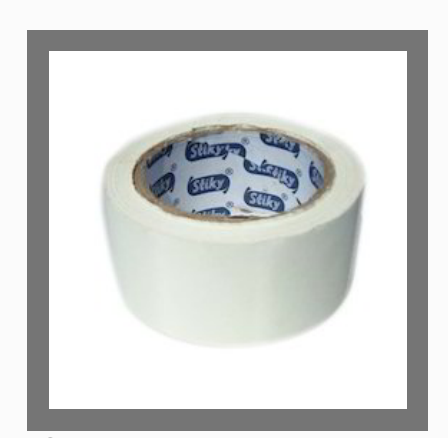
Glass Fiber Tapes