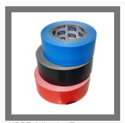
HDPE Adhesive Tapes