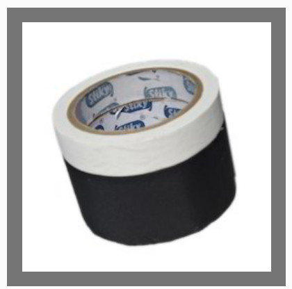
Nylon ( Shoe Upper ) Adhesive Tapes