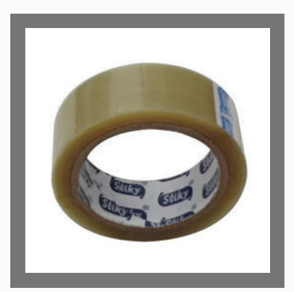
Rubber Based BOPP Adhesive Tapes